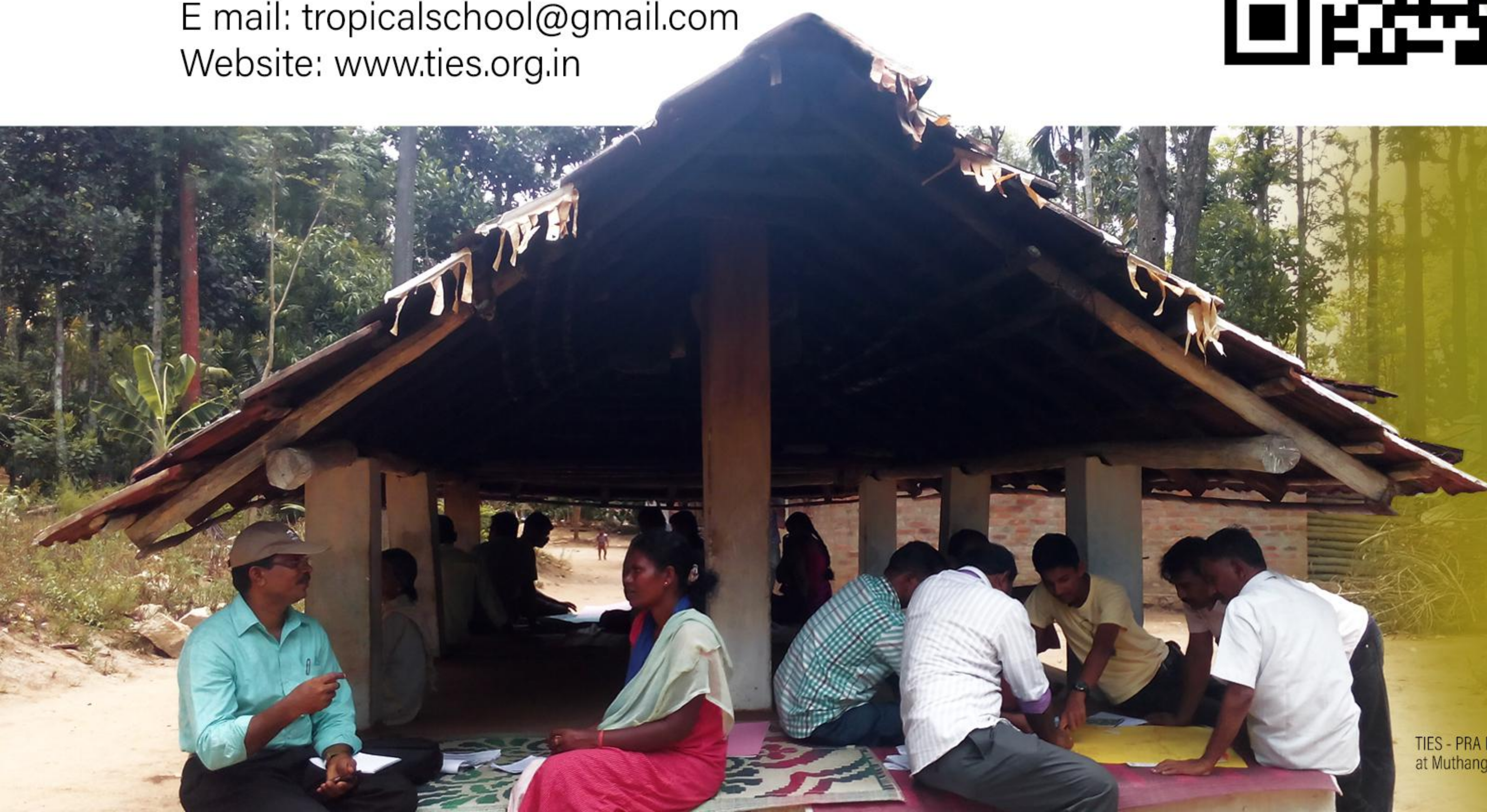
TIES - PRA Exercise at Muthanga forest